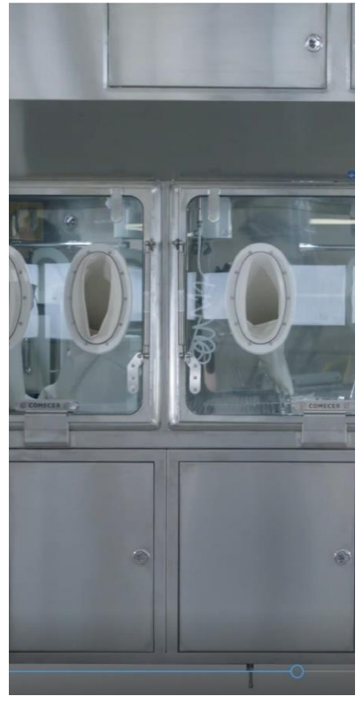
Biological Safety Cabinet

Our technology is very appreciated in H2O2 decontamination for small or medium sized volume. Indeed, our ability to produce very small droplets (05 \mu m) allows for same efficiency as VHP (vaporized hydrogen peroxide) devices but without the disadvantages. Indeed, our system remains small, easy to integrate and allows for short decontamination cycles (between 15mn to 1h).